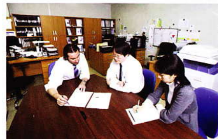
1 Aichi Venture House