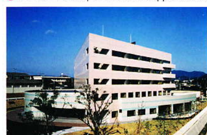
3 Toyohashi Science Core