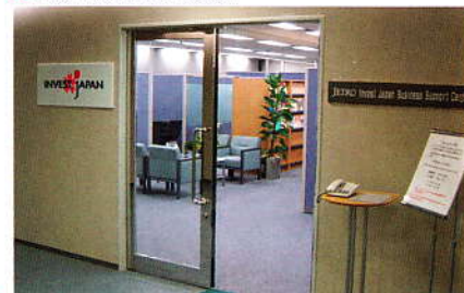
2 JETRO Invest Japan Business Support Center