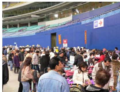
Bargain hunting is clearly not a spectator sport

While it's usually reserved for the Chunichi Dragons and their doomed opponents, in the off season Nagoya's boys of summer lend their field to less wealthy, less athletic folks during the Nagoya Dome Flea Market , which is held twice a year. The colossal event boasts gifts for hobbyists and delicious snack items from all over the country, but perhaps the most unique among the flea market's attractions is the section where unclaimed items from the nationwide rail system's lost-and-founds resurface after their obligatory claim period has expired.