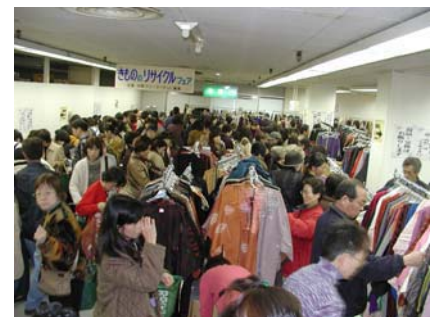
Hand-Me-Downs of a Geisha

Kimono , or traditional silk robes, are always high on the shopping lists of female travelers to Japan. The elegant garments are the perfect attire when visiting festivals or formal events during your travels, and they are increasingly finding their way into western wardrobes—even if in slightly altered form. But a new kimono can easily set you back over a thousand dollars, and a tight travel budget might force you to pass up the once-in-a-lifetime chance to buy the genuine article.